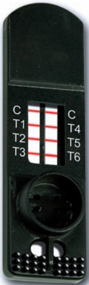
Drug Test Cassette # 008S901 AMP-OPI-THC/MTD-MET-COC